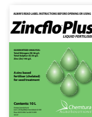
ZINCflo® PLUS Gets your crop off to a great start