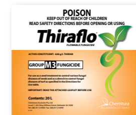
THIRAFLO® Unbeatable protection for lupins and chickpeas