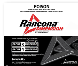
RANCONA® DIMENSION The power of root protection NEW