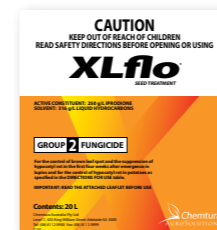
XLflo® Get your lupins covered early