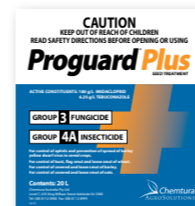
PROGUARD® PLUS Preventative for smuts, bunts and aphids