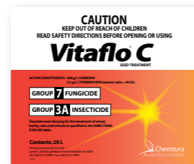
VITAFLO® C Effective disease control and strong germination