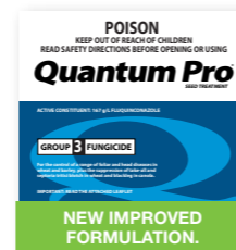
QUANTUM® PRO All round protection for seed, leaves and roots