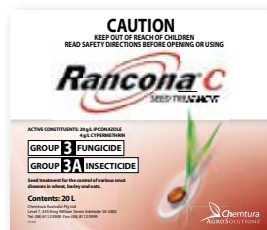
RANCONA® C Superior control of smuts and bunt