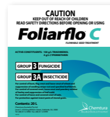
FOLIARFLO® C Dual protection for seed and leaves